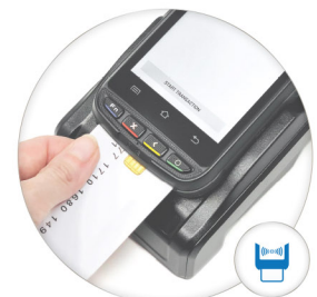
eWIC CARD READER